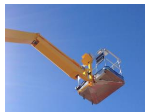
Flush basket mount